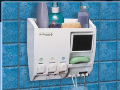
73350 Ulti-Mate Dispenser III with Mirror White