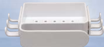
Snap-on soap dish with hooks included.

The Dispenser™ is becoming a standard bath feature!